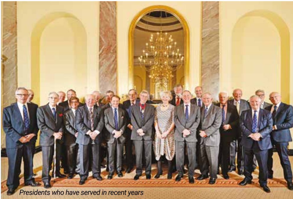
Presidents who have served in recent years