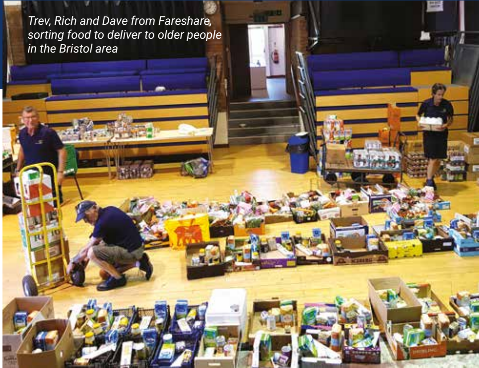
Trev, Rich and Dave from Fareshare, sorting food to deliver to older people in the Bristol area